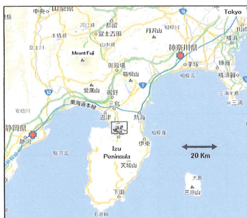
Figure 1: Map of Izu Peninsula. A photo taken from a helicopter indicating Juntendo Shizuoka Hospital where the helicopter parks. The two crosses indicate medical facilities with large medical equipment for recompression.