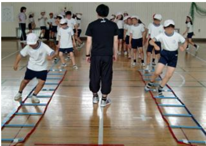
Figure 1. Agility ladder program (ALP).

rungs (squares) and not step on the ladder while moving their bodies as quickly as possible. For the quick run, participants ran over the ladder as fast as they could. For the lateral run, participants were instructed to stand inside a square, face the ladder's right or left side, and run sideways over the ladder. For the open and closed jump, participants repeatedly jumped into each square along the ladder, advancing one square at a time while alternately opening and closing both legs. For the two-leg zigzag step involves the child stepping with both feet simultaneously in left and right directions. The right foot is outside the square, and the left foot is inside the square when stepping to the front-right diagonally; the left foot is outside the square, and the right foot is inside the square when stepping to the front-left diagonally. The child moves one square forward at a time while doing this movement. The 27 participants in Group 1 were further divided into Group A ( n = 14 ) and Group B ( n = 13 ). One ladder was used by Group A, while the other was used by Group B. First, the instructor gave the participants a demonstration and then blew a whistle for the children to begin the activity.