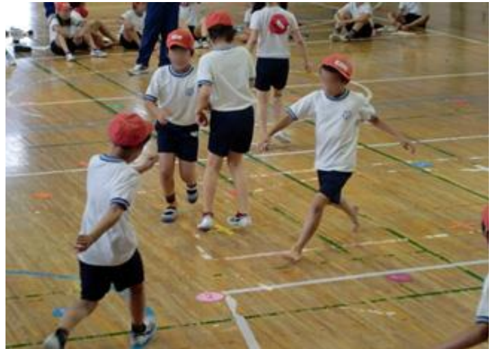
Figure 2. Droutability exercise program (DEP).

the activity in response to the instructions. The students were asked to move as swiftly as possible while avoiding collision with their classmates. The students participated in three sets of the 30-s intervention activity. The 19 participants in Group 2 were further divided into Group A ( n = 10 ) and Group B ( n = 9 ). A 1-min. set (play: 30 s; rest: 30 s) was conducted with Group A playing, while Group B rested, and vice versa. Three sets were conducted each time, with Groups A and B alternately playing and resting for 30 s.