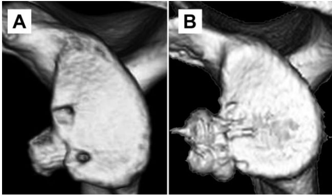
Figure 1. Three-dimensional computed tomography reconstruction of the glenoid after the (A) Bristow procedure and (B) Latarjet procedure.

therapist. Active exercises were started at 4 weeks postoperatively, and normal activities of daily living were allowed thereafter. CT was conducted to ensure bone healing of the coracoid graft at 12 weeks postoperatively (Figure 1). A strengthening program followed by rugby practice was then begun, and full return to play was allowed at 5 months postoperatively. If bone healing was not evident at 12 weeks postoperatively, CT was repeated at 16 weeks postoperatively, and a strengthening program was initiated, regardless of the presence of bone union.